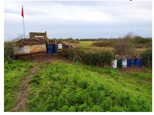
Barrier that westernmost sentry box