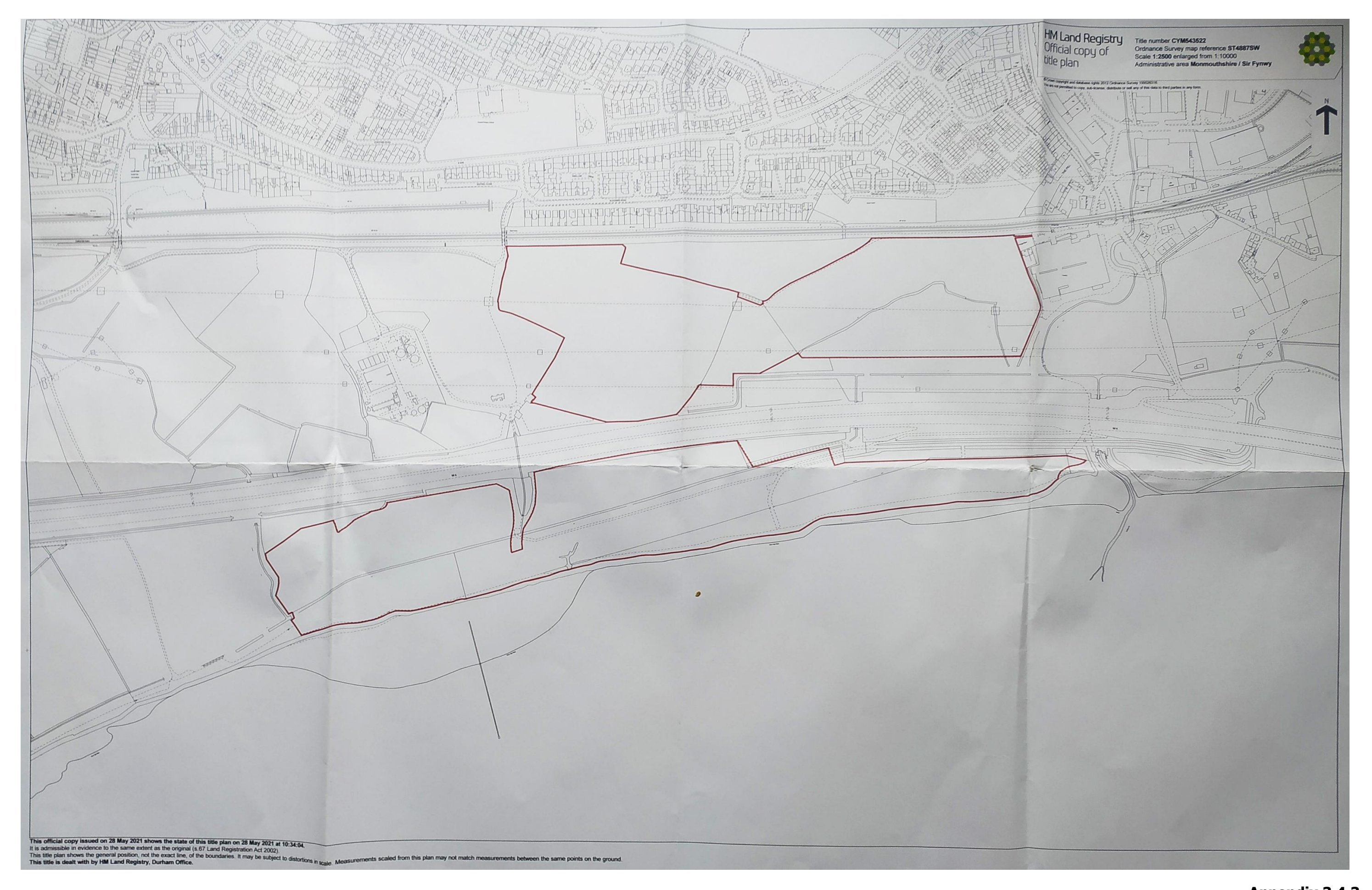
Appendix 3.4.3 Land registry title deed (map) CYM543522 (Insert – Preceding notes official copy issued 28/05/2021 at 10:34:04)